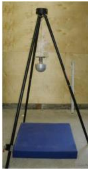
Figure 2. Example Drop Test from ASET Service

The elasticity of the materials can also be examined under the same impact test as previously mentioned. If the material can withstand repeated impacts simulating a hit from a football player then return to shape, then the material will react elastically enough for our design. After each test the material length width and height will be measured with a caliper to determine any changes have been made. While durability over time is an important function, the timeline for this project cannot account for long term experiments. Due to this, associations of long-term durability are connected to multiple and repetitive compression tests of materials for elasticity.