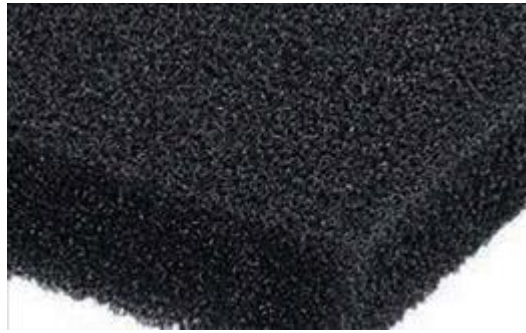
Figure 6: Example of Open Cell Structure Foam