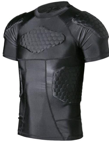
Figure 5: Padded Compression Under Shirt

padding. This design will replace the padding in the shoulder, chest, and rib area with the foam used with a non-Newtonian fluid.