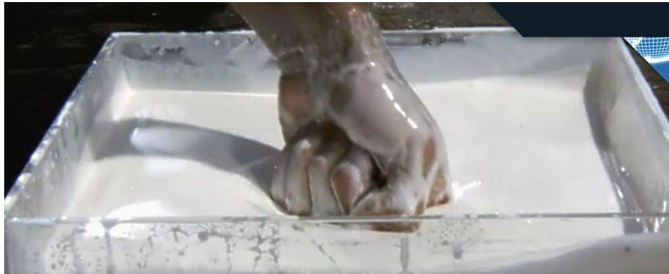
Figure 3: Non-Newtonian Fluid Taking Impact from Punch